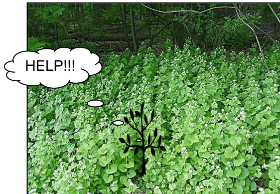
Infestations, such as this garlic mustard, limit the growth of tree seedlings.